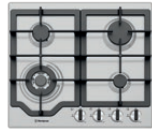
Westinghouse 600mm Gas Cooktop