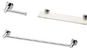
Radii 600mm Single Towel Rail, Toilet Roll Holder & Glass shower shelf in Chrome