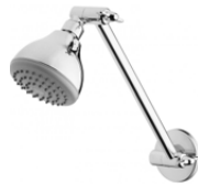
Ivy Shower Arm & Rose