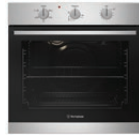
Westinghouse 600mm Electric Oven