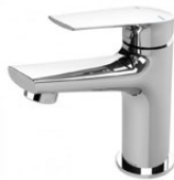
Phoenix Arlo Basin Mixer