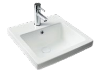
Seima Kyra 017 Square Basin